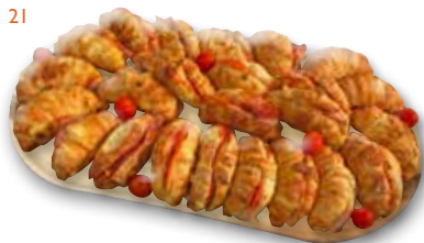
MINI CROISSANTS (V Option)