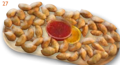
CURRY PUFFS VN H