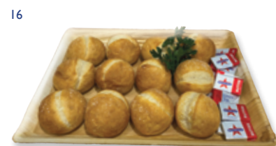
RUSTIC DINNER ROLLS & BUTTER