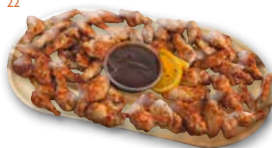
BUFFALO WINGS H