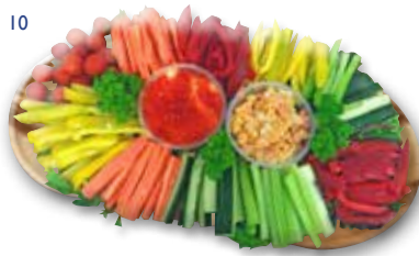
VEGETABLE CRUDITÉS & DIPS V GF