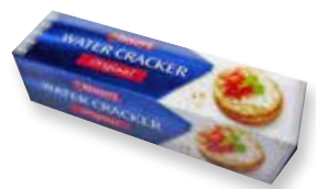
15 WATER CRACKERS