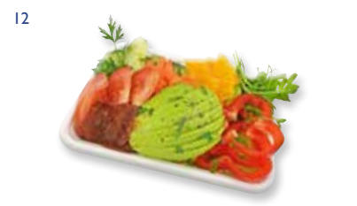
DIETARY SALAD BOWL V GF VN H