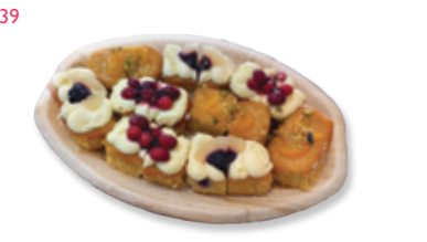
MINI CAKES GF