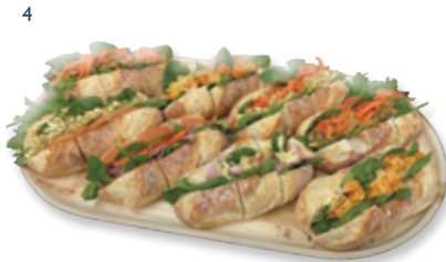
MINI STONE BAKED BREADS Inc.V