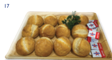
17 RUSTIC DINNER ROLLS & BUTTER