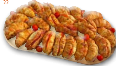
MINI CROISSANTS (V Option)