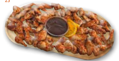
BUFFALO WINGS H