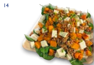
14 PUMPKIN, WALNUT, FETA SALAD V GF