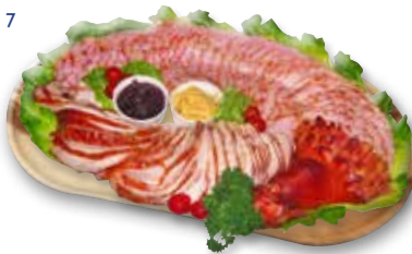
7 TURKEY & HONEY GLAZED HAM