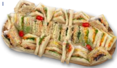
1 SANDWICH Inc.V