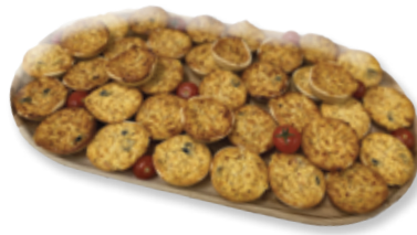
SPINACH QUICHE V