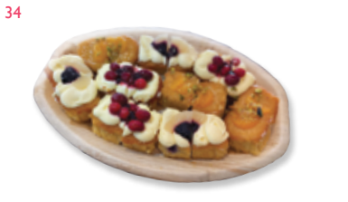
MINI CAKES GF