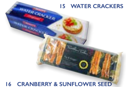
15 WATER CRACKERS