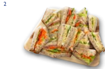
2 GLUTEN FREE SANDWICH Inc.V GF (VN Option)