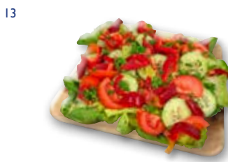
13 GARDEN SALAD V GF