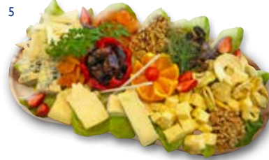
5 GOURMET CHEESE & DRIED FRUIT V GF