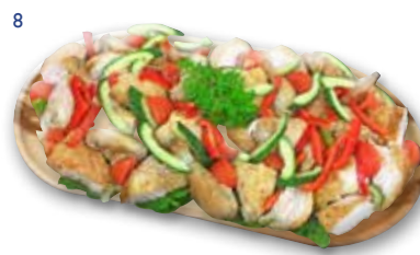
8 ROAST CHICKEN GF H