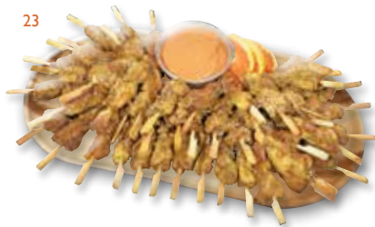
CHICKEN SATAY GF H