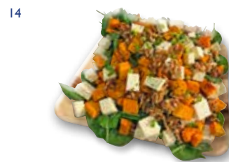
14 PUMPKIN, WALNUT, FETA SALAD V GF