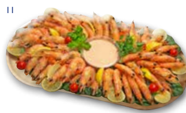
11 COLD PRAWNS GF