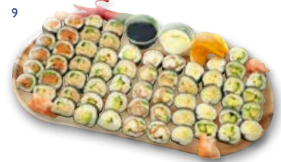
9 SUSHI Inc.V Inc.GF H