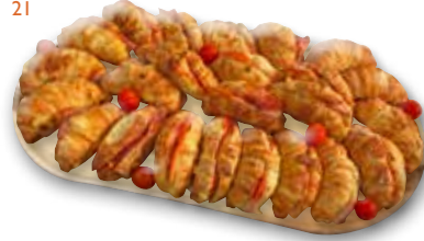
MINI CROISSANTS (V Option)