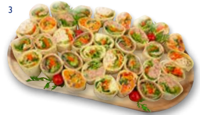
3 MINI WRAPS Inc.V