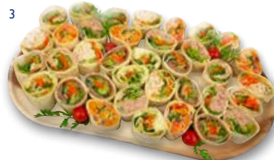
MINI WRAPS Inc.V