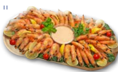
COLD PRAWNS GF