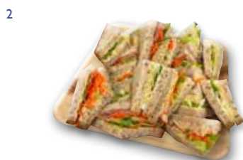
GLUTEN FREE SANDWICH Inc.V GF (VN Option)