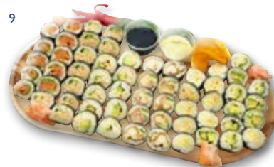
SUSHI Inc.V Inc.GF H