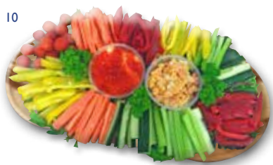
VEGETABLE CRUDITÉS & DIPS V GF