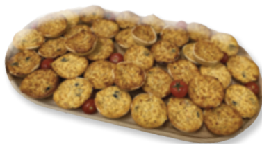
MEDITERRANEAN QUICHE V