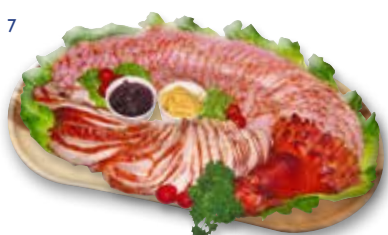
TURKEY & HONEY GLAZED HAM