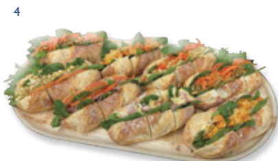
MINI STONE BAKED BREADS Inc.V