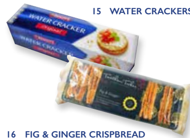
15 WATER CRACKERS