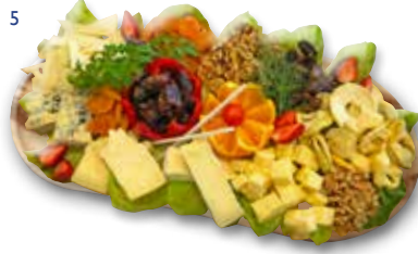
GOURMET CHEESE & DRIED FRUIT V GF