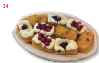
MINI CAKES GF