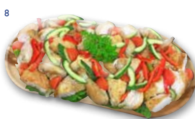
ROAST CHICKEN GF H