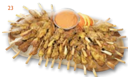
CHICKEN SATAY GF H