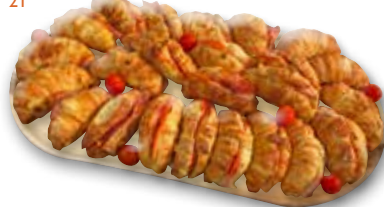
MINI CROISSANTS (V Option)