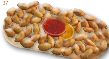
CURRY PUFFS V H