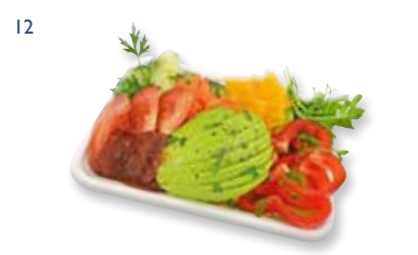
DIETARY SALAD BOWL V GF VN H