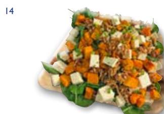
PUMPKIN, WALNUT, FETA SALAD V GF